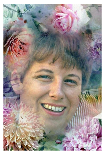
<u>Poem "My Soul Garden"</u>